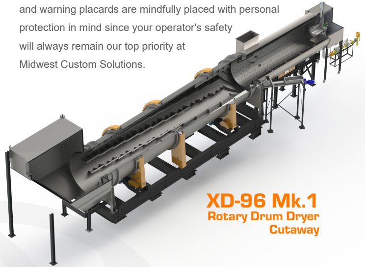
XD-96 Mk.1 Rotary Drum Dryer Cutaway

Trommel drive mechanism and pinch-point guards, burner heat shields and warning placards are mindfully placed with personal protection in mind since your operator's safety will always remain our top priority at Midwest Custom Solutions.