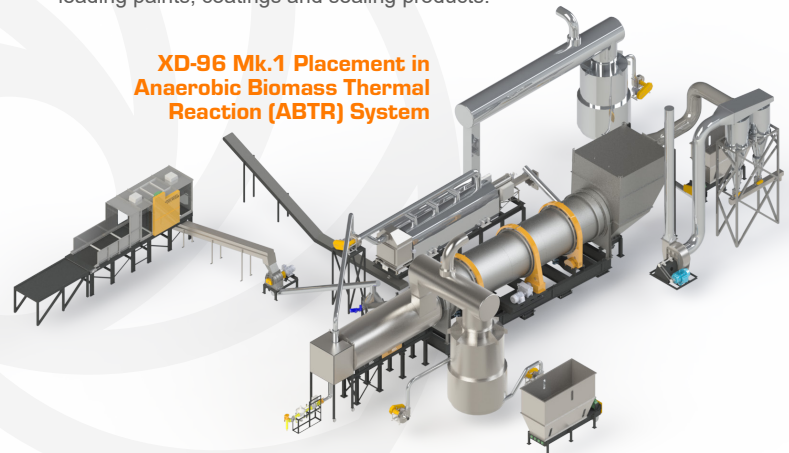
XD-96 Mk.1 Placement in Anaerobic Biomass Thermal Reaction (ABTR) System

At Midwest Custom Solutions, we diligently strive to build value into every facet of our products, ensuring all of our equipment provides the longest-lasting, greatest value for your investment dollars.